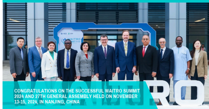
CONGRATULATIONS ON THE SUCCESSFUL WAITRO SUMMIT 2023 AND 77th GENERAL ASSEMBLY HELD ON NOVEMBER 13-15, 2024, IN NANJING, CHINA

Created by TISTR as a WAITRO Regional Focal Point (RFP) for Asia and the Pacific, 2023-2024