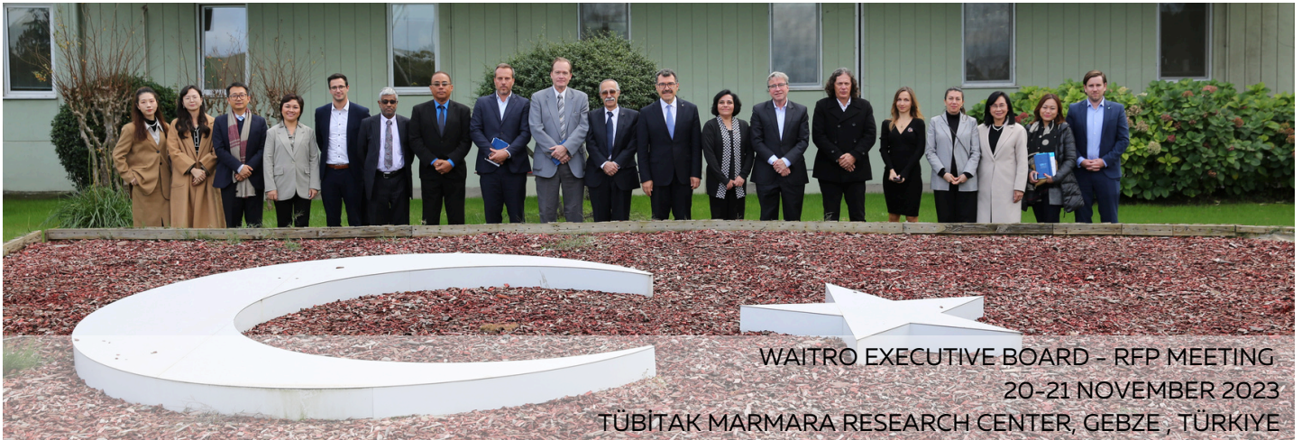
WAITRO EXECUTIVE BOARD – RFP MEETING 20-21 NOVEMBER 2023 TÜBİTAK MARMARA RESEARCH CENTER, GEBZE, TÜRKİYE

Created by TISTR as a WAITRO Regional Focal Point (RFP) for Asia and the Pacific